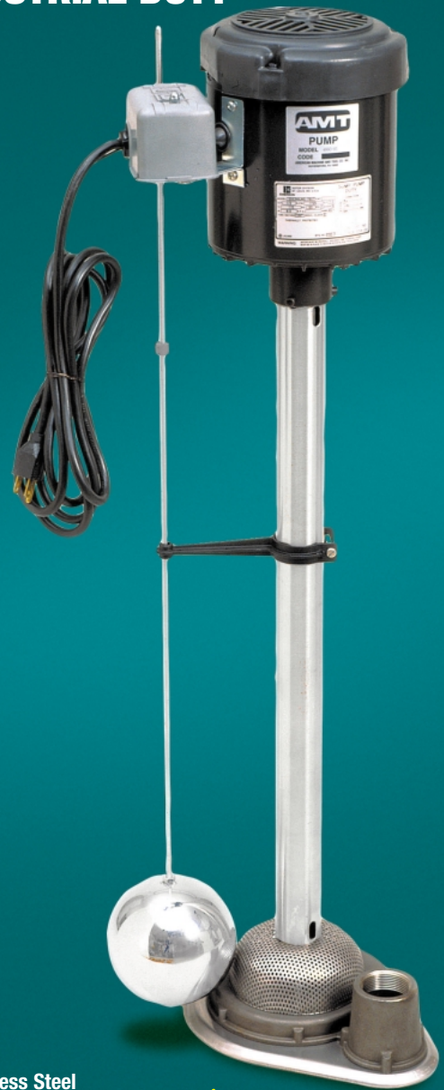
Stainless Steel TEFC Model Sump Pump