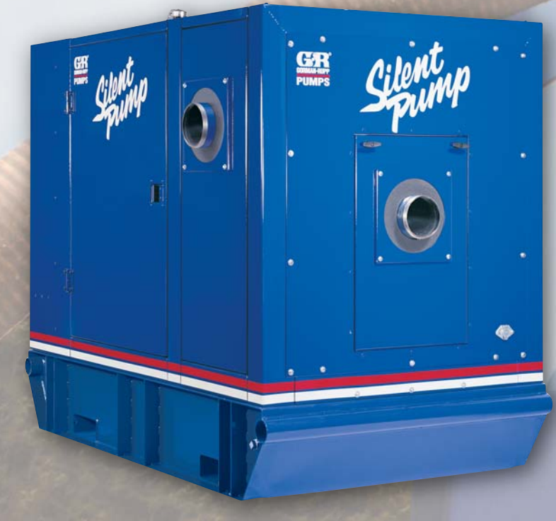
Next Generation Silent Pump Quiet Operation and Environmental Safeguards