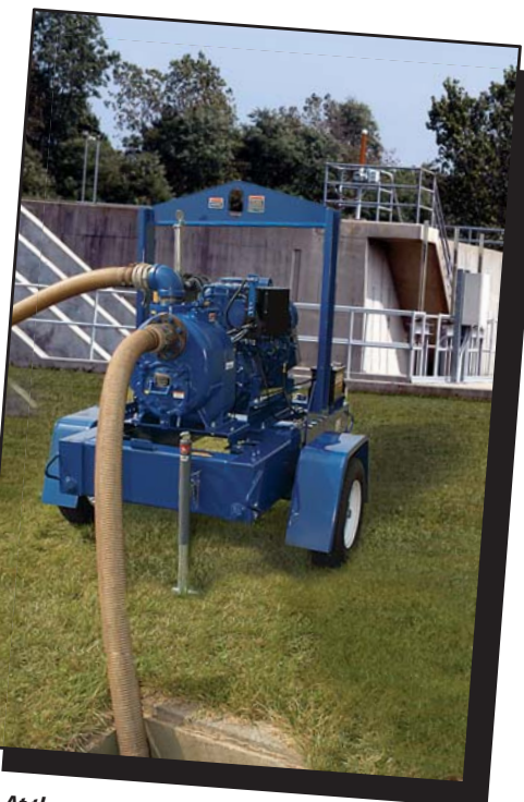
At the municipality... bypassing a pump station during repairs.