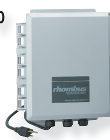
PW217-280 Control Panel Required (sold separately)