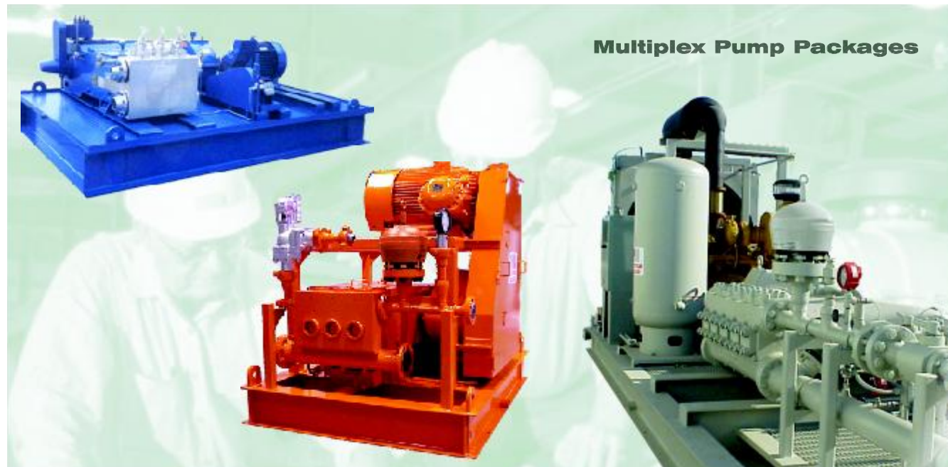
Multiplex Pump Packages