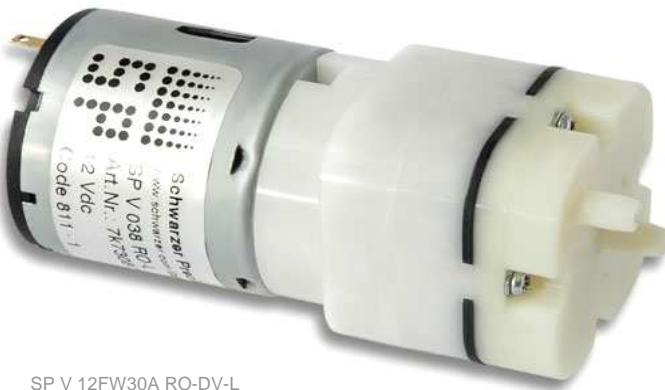
SP V 12FW30A RO-DV-L