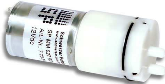
SP V 12TW27A RO-VD/L