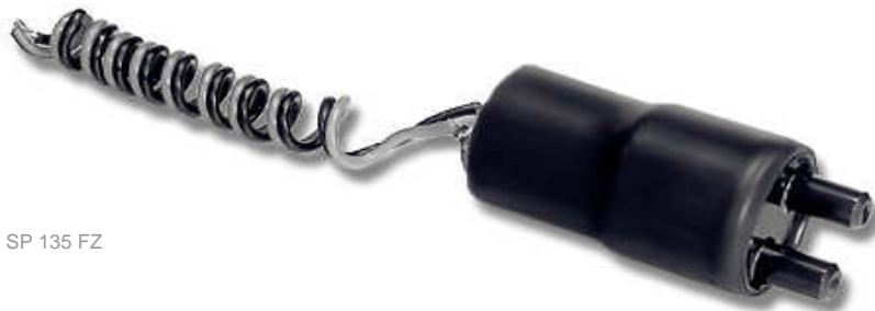
SP 135 FZ