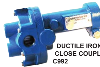
DUCTILE IRON CLOSE COUPLED C992