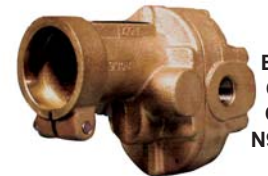
BRONZE CLOSE COUPLED N991