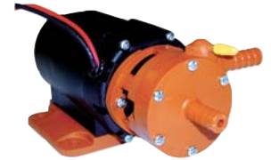
PLASTIC CENTRIFUGAL 144