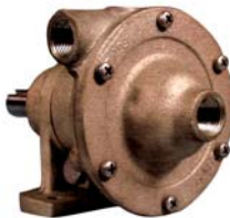
BRONZE CENTRIFUGAL 50P