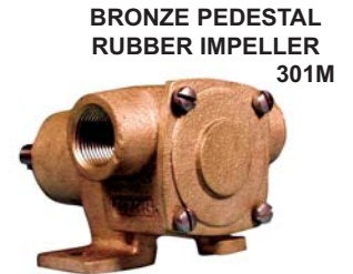
BRONZE PEDESTAL RUBBER IMPELLER 301M