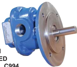
DUCTILE IRON CLOSE COUPLED C994