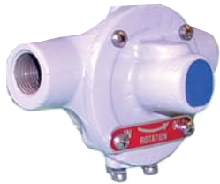
RUBBER ROLLER 310F