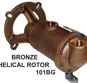
BRONZE HELICAL ROTOR 101BG