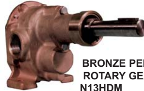
BRONZE PEDESTAL ROTARY GEAR N13HDM