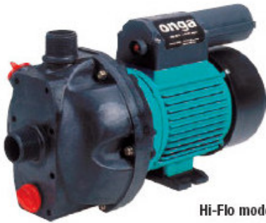
Hi-Flo model 112